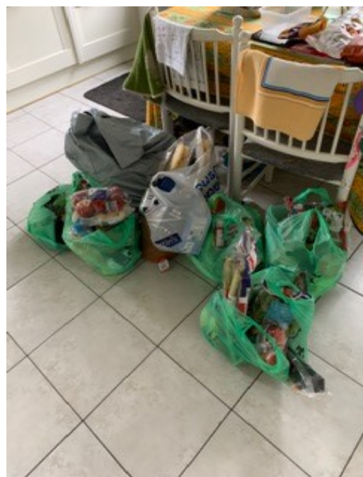
Doreen's food bags awaiting delivery