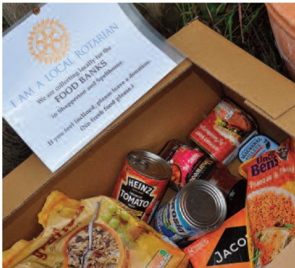
A simple empty cardboard box and sign has helped put food on many needy resident's tables.

We are use to the generosity of our highly committed Rotarians in the Shepperton area but we are totally astounded and humbled at the unrelenting generosity of so many, many friends and neighbours.