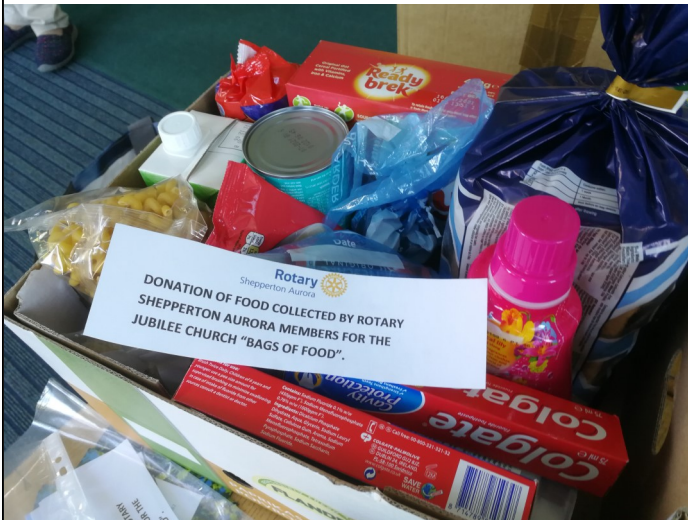
A note goes into bags saying donated from the community via Rotary